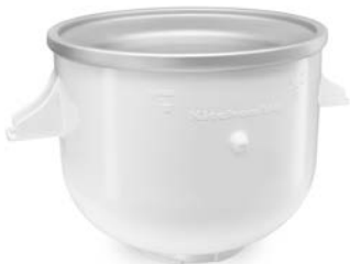
KitchenAid® Ice Cream Maker Model No. KAICA

Purchase a select KitchenAid® Stand Mixer* and receive a FREE Ice Cream Maker (a $79.99 value) by mail.