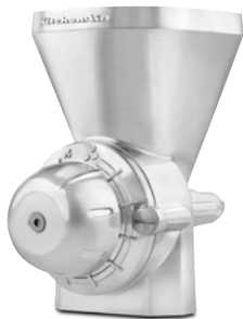
KitchenAid® All-Metal Grain Mill Model No. KGM

Purchase a select KitchenAid® Stand Mixer* and receive a FREE All-Metal Grain Mill (a $129.99 value) by mail.