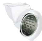
KitchenAid® Rotor Slicer/ Shredder Model RVSA